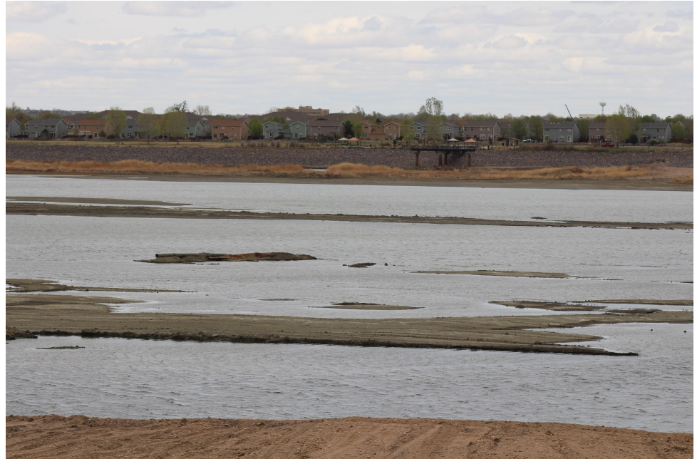
Ken Mitchell Park