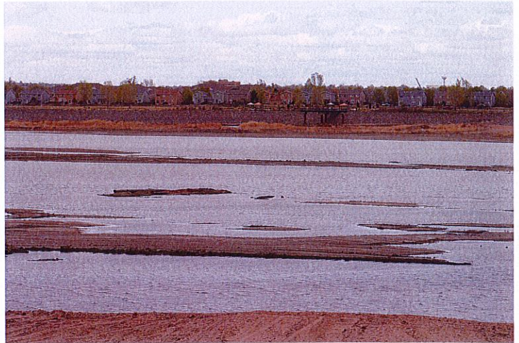
Ken Mitchell Park