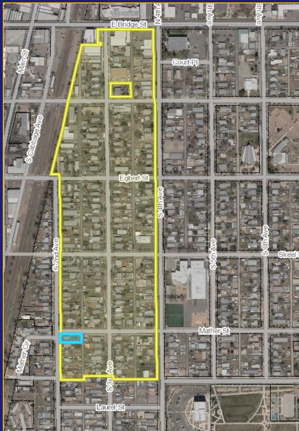
Aerial Map of the Walnut Grove Addition