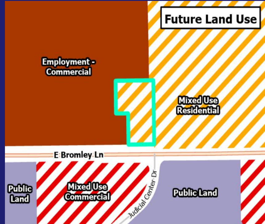
Future Land Use Map