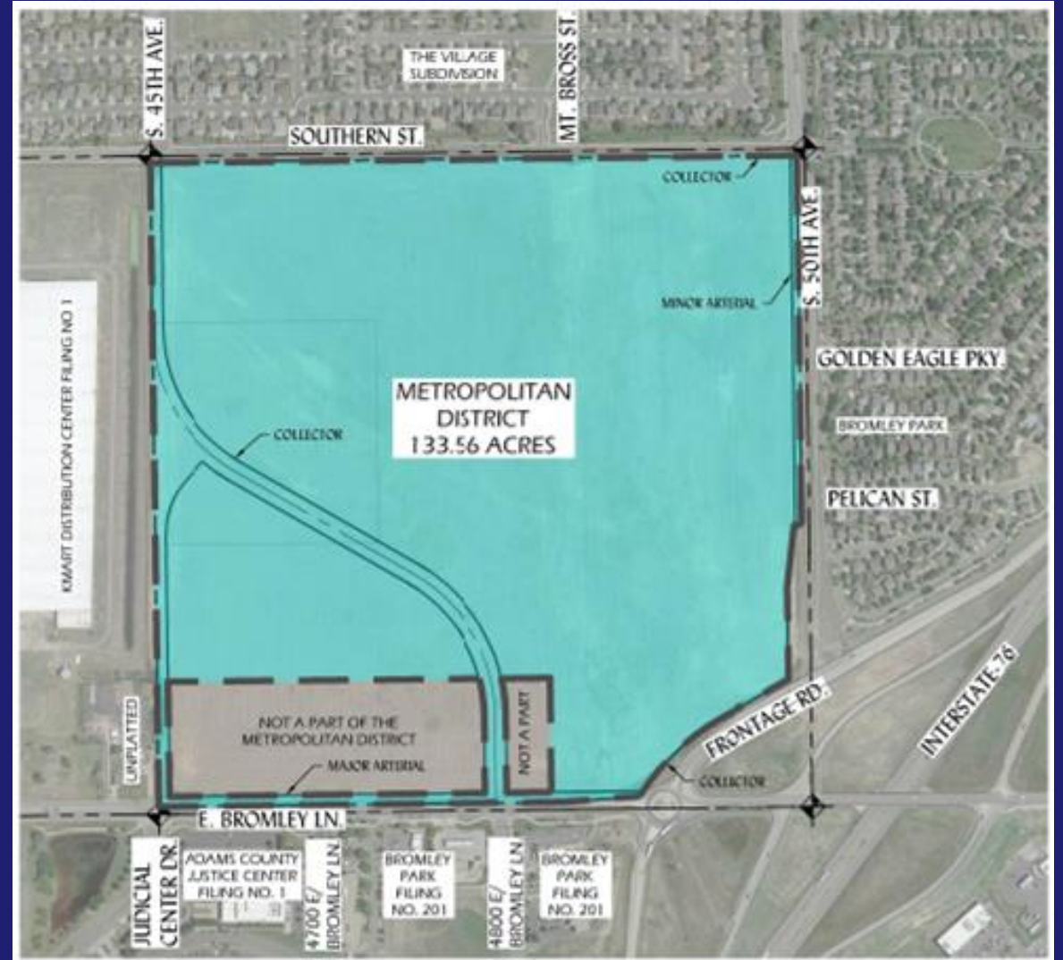
Metro District Boundary Map