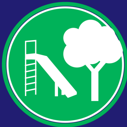
Facilities, Amenities, and Open Space