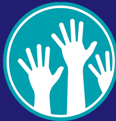
Safe Active and Engaged Community