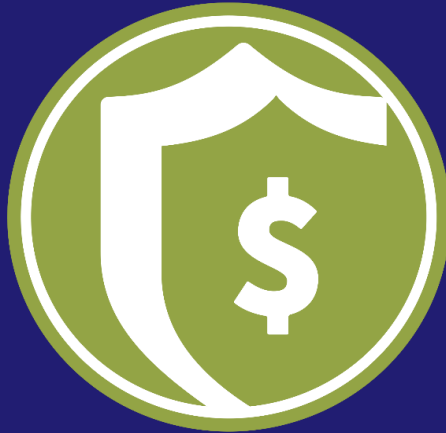
STRATEGIC FOCUS AREA Financially Responsible