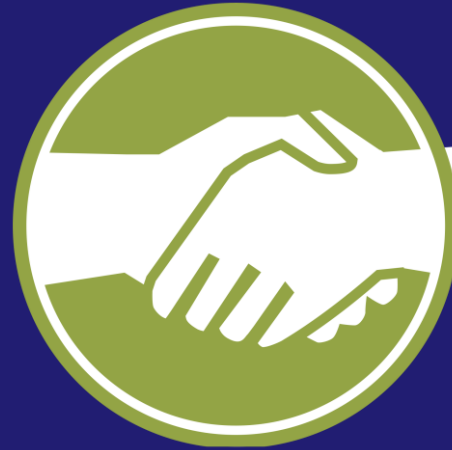
STRATEGIC FOCUS AREA Regional Partnerships