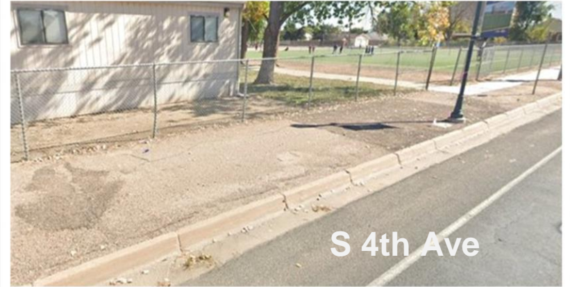
S 4th Ave