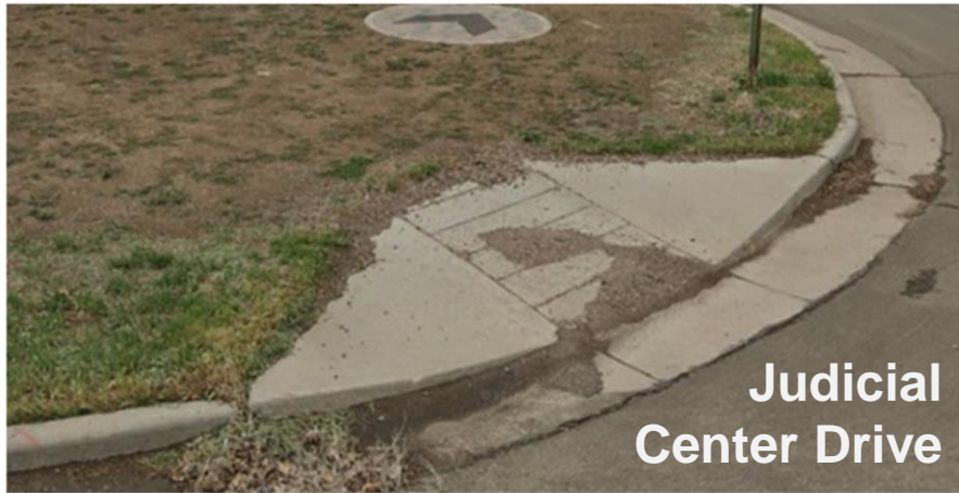
Judicial Center Drive