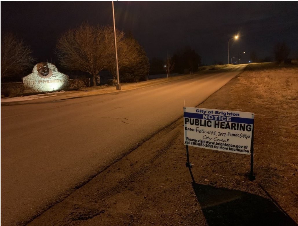
#3 Intersection of E 164 th Ave and Telluride St.