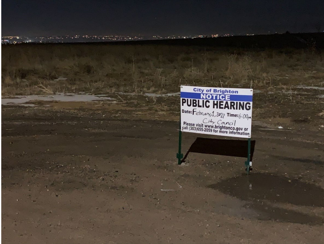
#4 Tract B of the Mountain View Estates Subdivision Filing No. 2