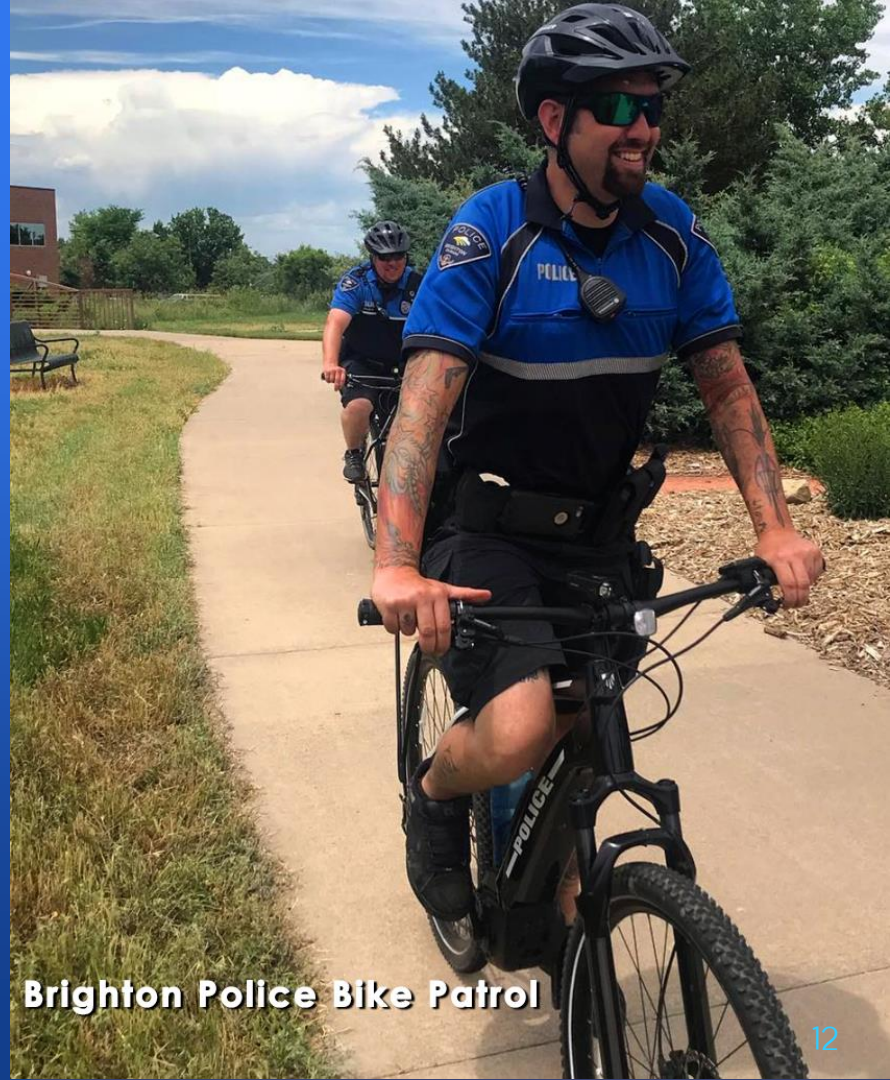
Brighton Police Bike Patrol