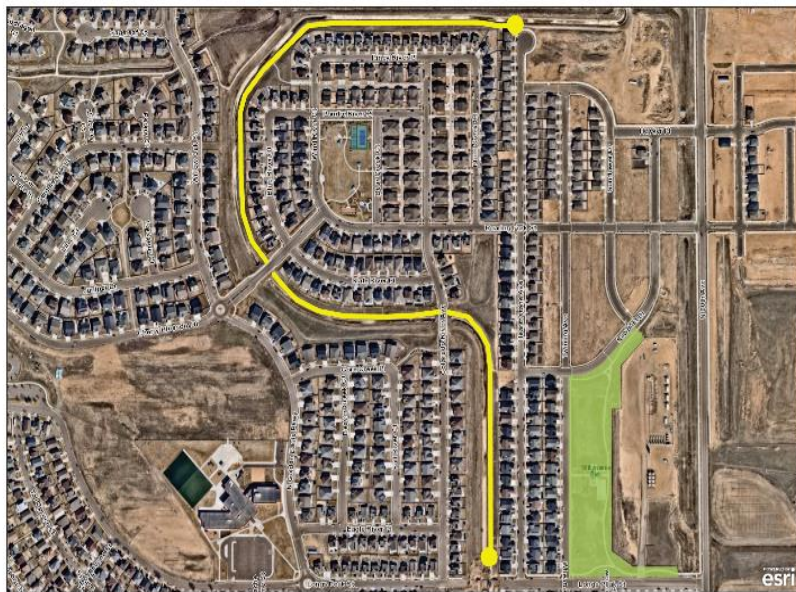
Speer Canal Trail - North Section