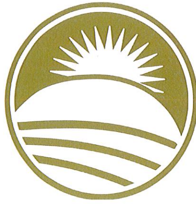
Recognizable and Well-Planned Community