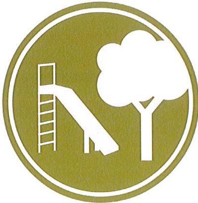
Facilities, Amenities, and Open Space