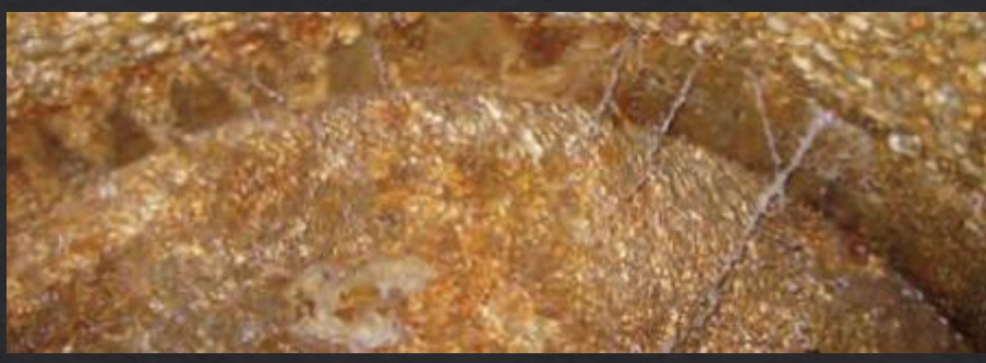
Moisture barrier application