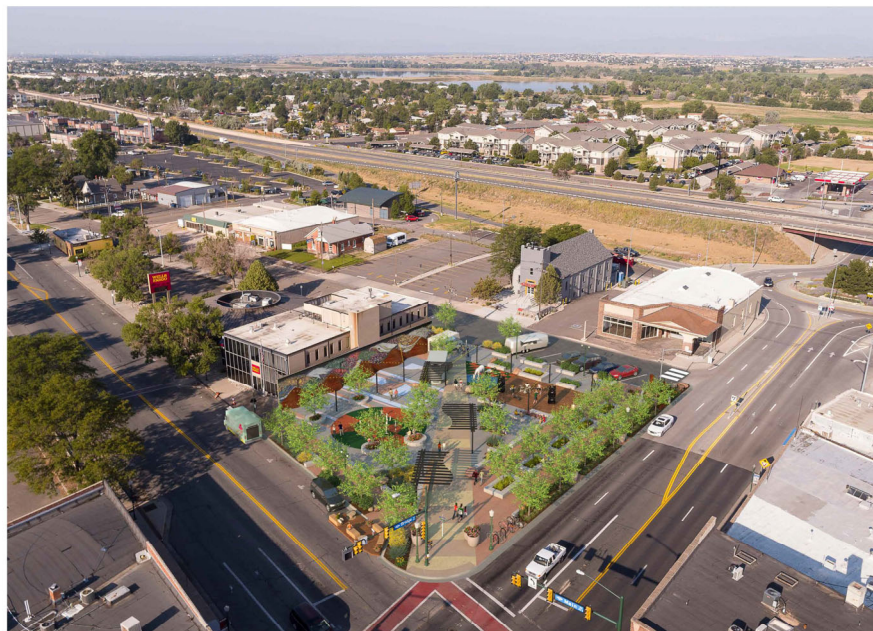
FOUNDERS PLAZA | MASTER PLAN CONCEPT BIRDSEYE PERSPECTIVE 01.10.2020