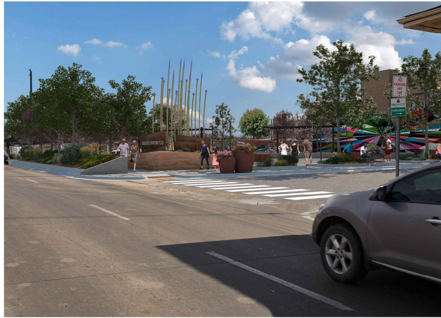
FOUNDERS PLAZA | PHASE I 3D PERSPECTIVE 01.10.2020