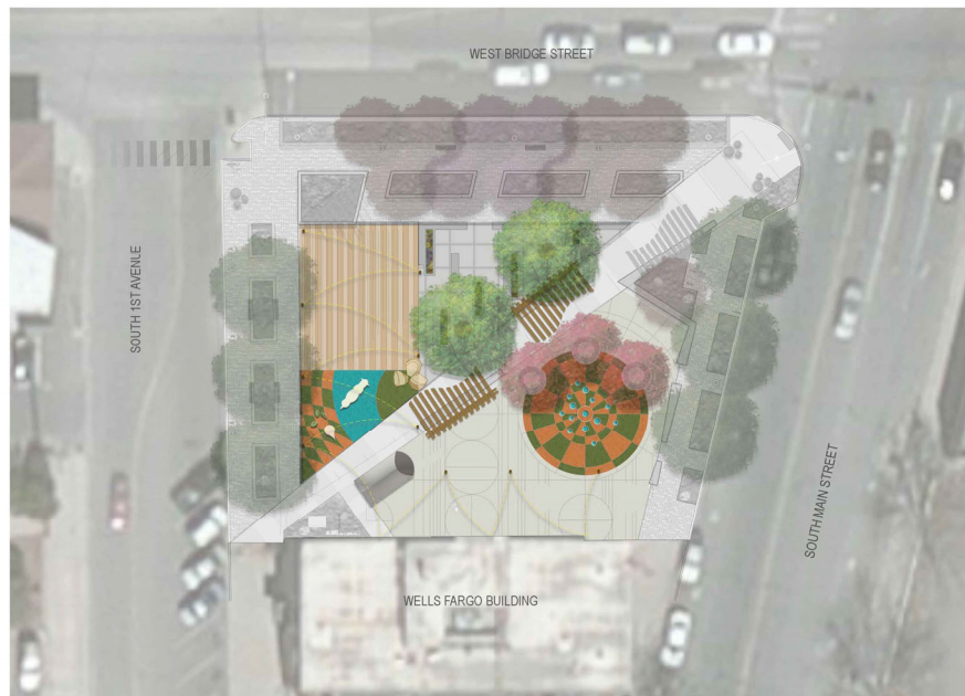
FOUNDERS PLAZA | PHASE II 01.10.2020