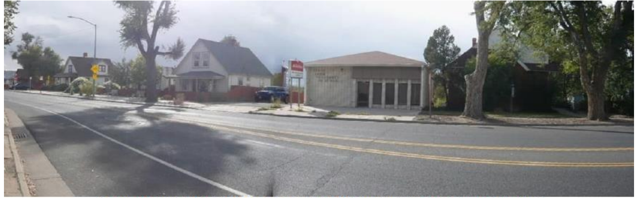
LOOKING SOUTHWEST ACROSS SOUTH MAIN STREET AT SUBJECT PROPERTY

The property is approximately 1,152 Square Feet