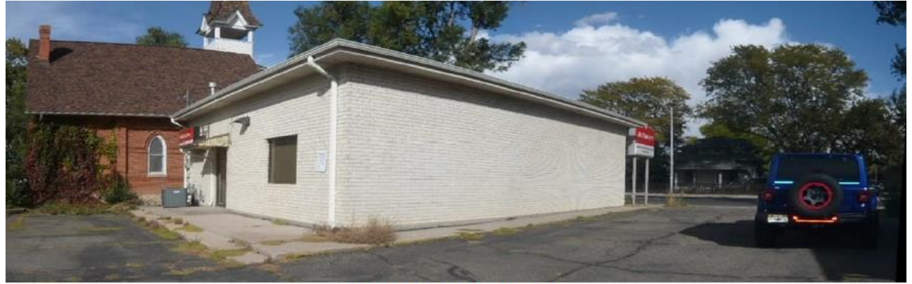
REAR OF SUBJECT PROPERTY

The property is approximately 1,152 Square Feet