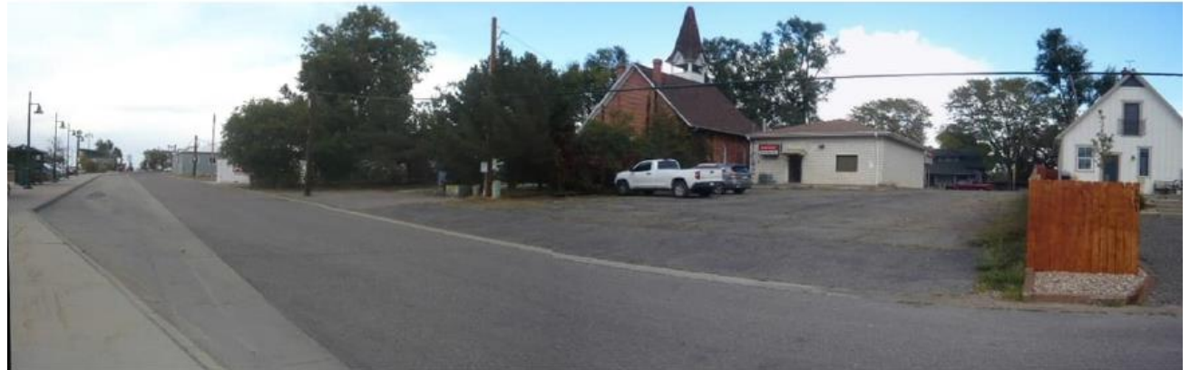
LOOKING NORTHEAST ACROSS PAVILIONS PLACE AT REAR OF SUBJECT PROPERTY AND PARKING AREA