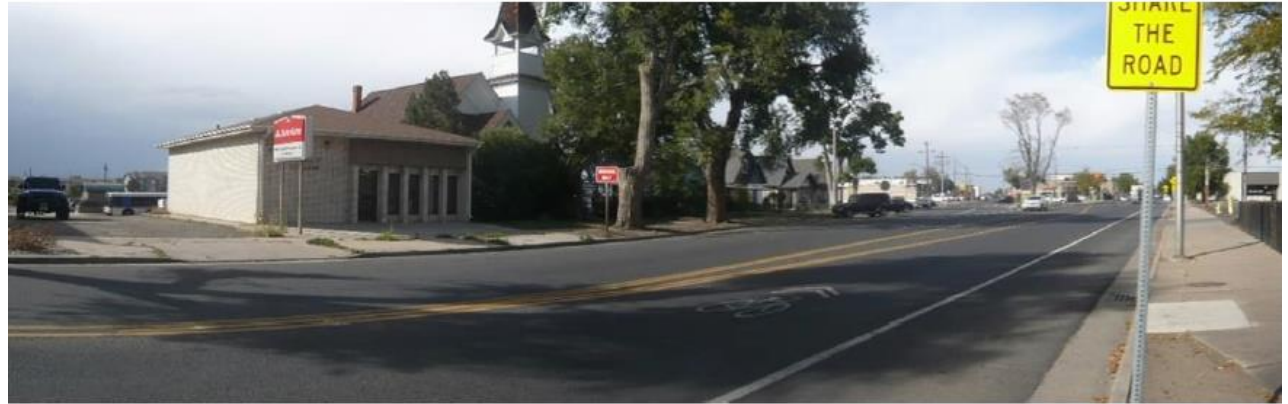
LOOKING NORTHWEST ACROSS SOUTH MAIN STREET AT SUBJECT PROPERTY