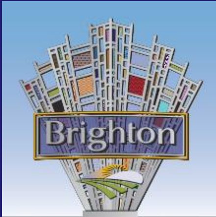
Primary Gateway Sign