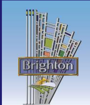
Secondary Gateway Sign