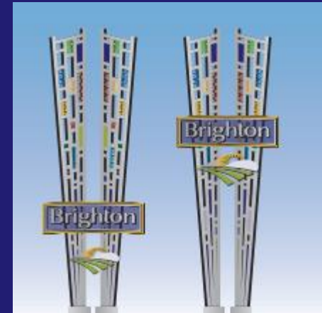
Tertiary Gateway Sign