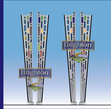
Tertiary Gateway Sign