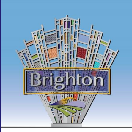
Primary Gateway Sign