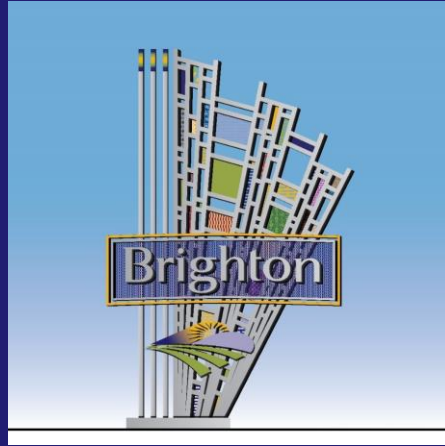
Secondary Gateway Sign